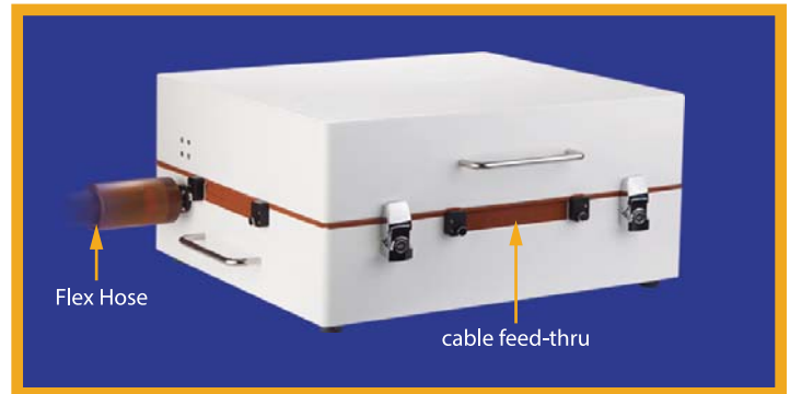
Compact Chamber Clamshell Model Chamber 14Wx16Dx6.2H inches