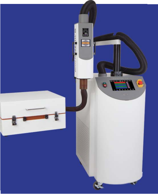
TA-5000A with Compact Chamber Clamshell