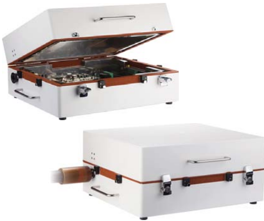
Clamshell Compact Chamber Open/Close Easily