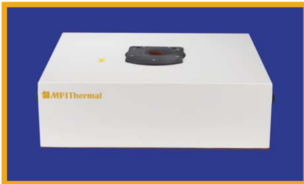
See Compact Chamber Hood Model Chamber Data Sheet