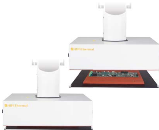
Hood Compact Chamber up/down on test component