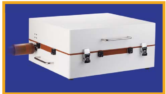
Compact Chamber Clamshell Model

Note: See Compact Chamber Clamshell data sheet