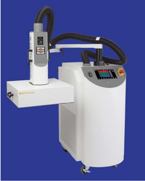
TA-5000A with Compact Chamber Hood