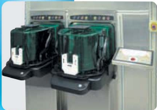
300 mm Load Ports