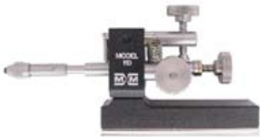
110 / 210 Series Manipulators