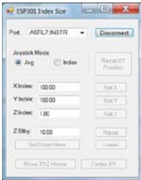
Indexing and Platen Up/ Down Apps