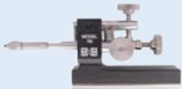
110 / 210 style manipulators