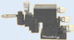
525 / 2525 style manipulators