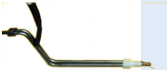
79 series probe holders