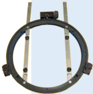
8800 series Probe Card Holder