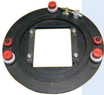
9000 series Probe Card Holder