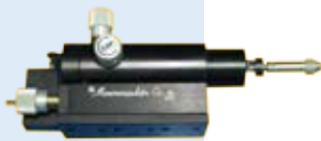
450 / 550 style manipulators